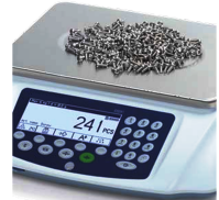
Weight & Count Chart of Popular fasteners